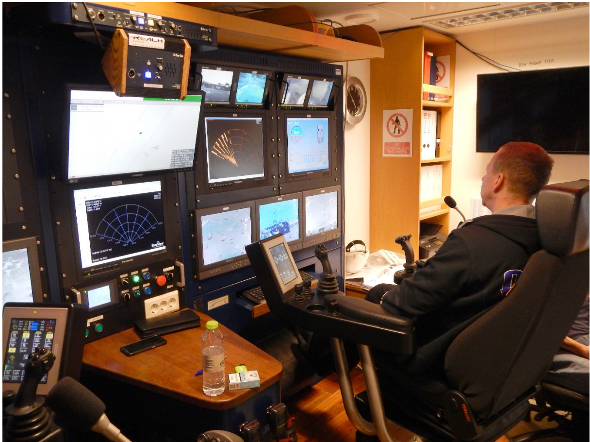
Online room DP2 ship